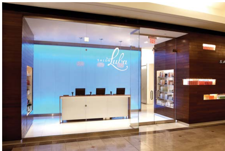
Style meets substance at the elegant Salon Luba.

› Zoku Salon , Summit, 908.273.9658, zokusalon.com