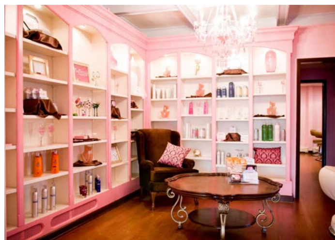
Pamper yourself at Pink Comb, an oasis of femininity and sophistication.